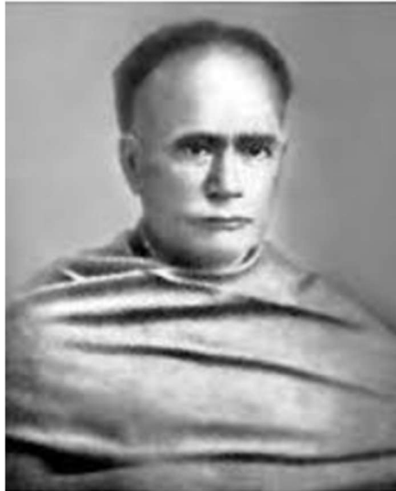
Ishwar Chandra Vidyasagar