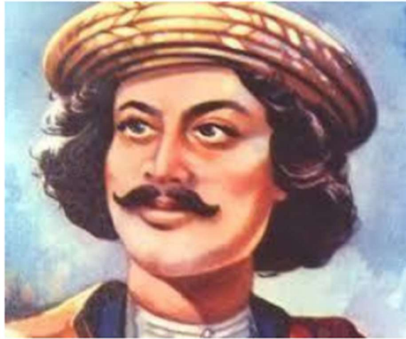
Raja Rammohun Roy

Ishwar Chandra Vidyasagar also used ancient scriptures for advocating remarriages of widows. The British in 1856 legalised remarriages of widows. In the Madras Presidency, Veerasalingam formed an association for widow remarriages. Dayanand Saraswathi also supported widow remarriages. However, at the same time, many people were also opposing the work of reformers.